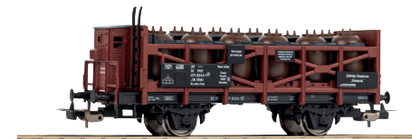
# 24516 Acid car PKP IV