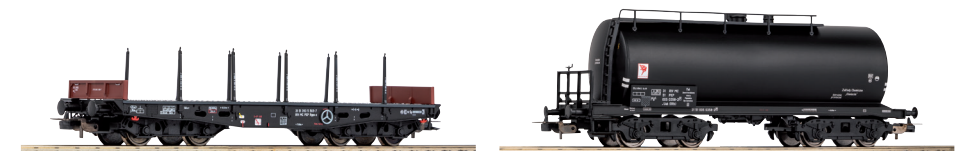
# 58414 Stake car 4012 PKP IV

Suitable additions for faithful reproductions of train formations: