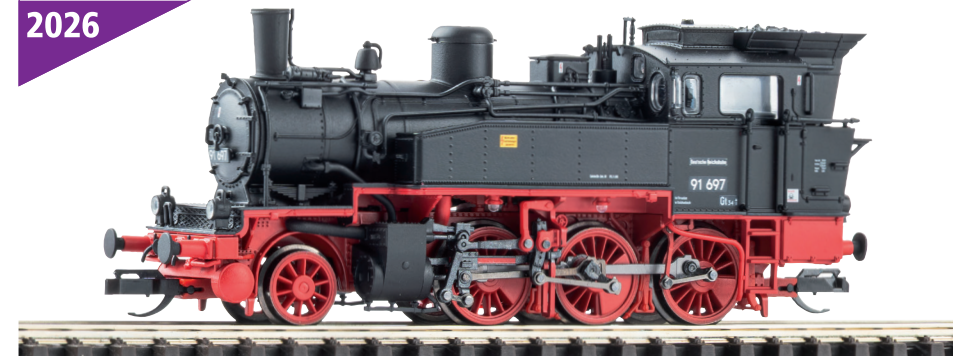
Steam loco Class 91.3 DR III 47150