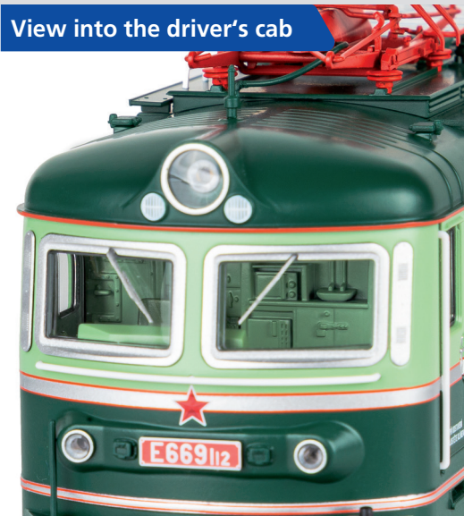
View into the driver's cab