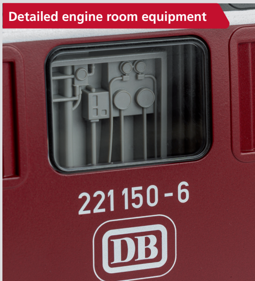
Detailed engine room equipment