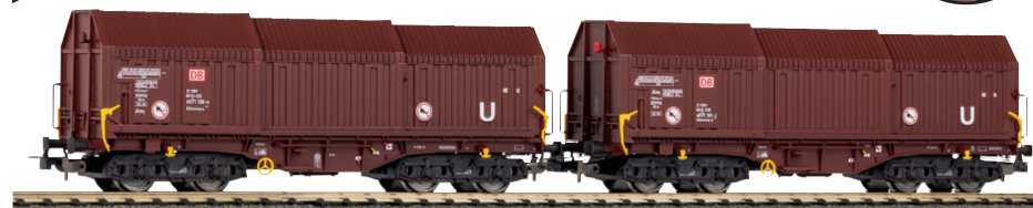
58293 Set of 2 Telescoping Coil Cars DB Cargo VI