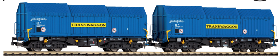
58296 Set of 2 Telescoping Coil Cars Transwaggon V