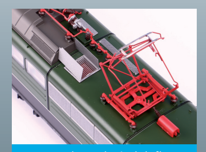
Pantographs and wind deflectors