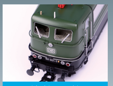
Front with driver's cabin