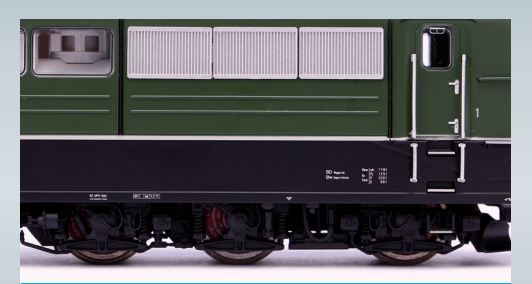
Bogies with red wheel discs