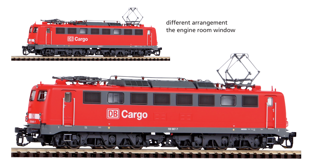
47460 Electric locomotive class 150 DB AG Ep. V 47461 Electric locomotive/Sound class 150 DB AG Ep. V

The PIKO TT model of the striking electric locomotive impresses with a precise implementation of the body shape, attached handlebars, sharply engraved bogies and filigree metal pantographs. The serially installed lighting in the driver's cab and engine room as well as the taillights that can be switched on and off digitally with a Next18 decoder increase the fun factor of this beautifully designed locomotive. The model with two traction tires for maximum traction power has a Next18 digital interface and is prepared for easy retrofitting with a decoder. The sound version has a built-in modern PIKO SmartDecoder 4.1 Sound of the latest generation ex works. The built-in loudspeaker is precisely matched to the locomotive type. Many typical locomotive sounds such as the typical engine noise, horns, squeaking brakes and other switchable functions can be selected. Brake hoses and hook couplings for retrofitting are included.